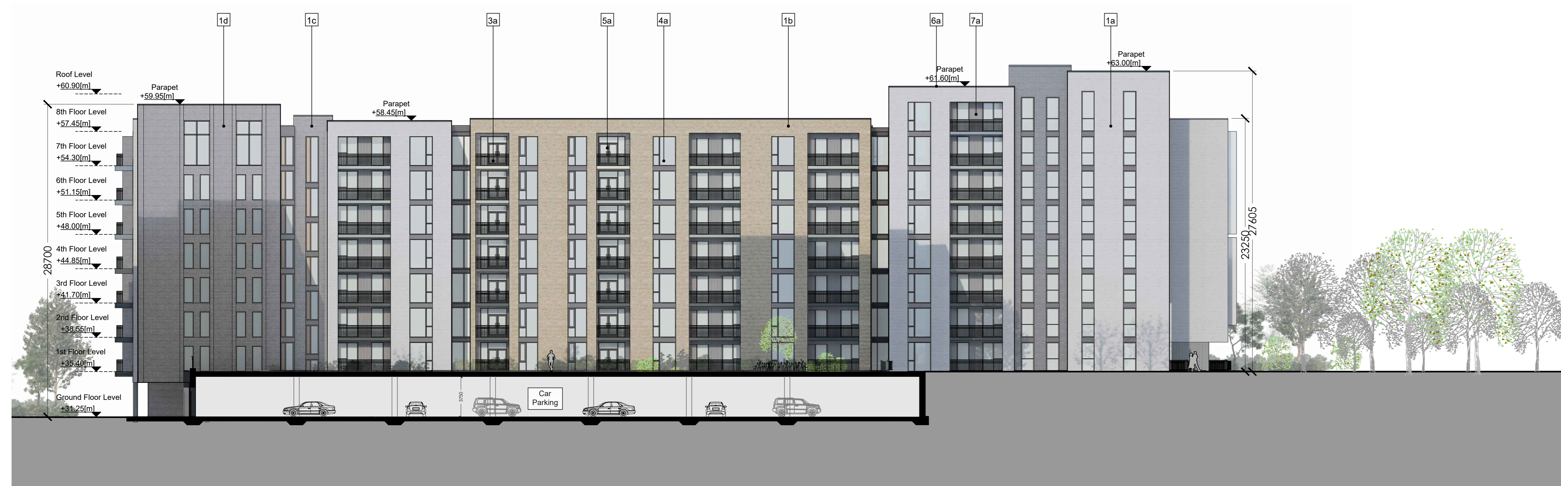
02 - West Courtyard Elevation - Block 4

Note: 1.8mm high glass balustrade can be provided on the upper level balconies if required by the Planning Authority.