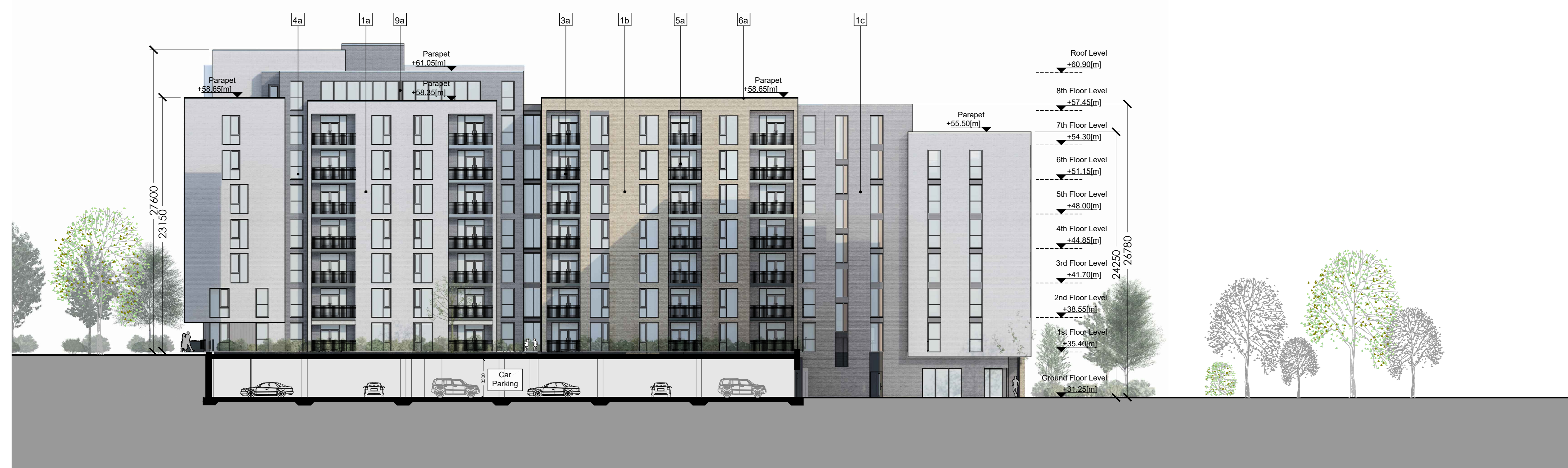
03 - East Courtyard Elevation - Block 4