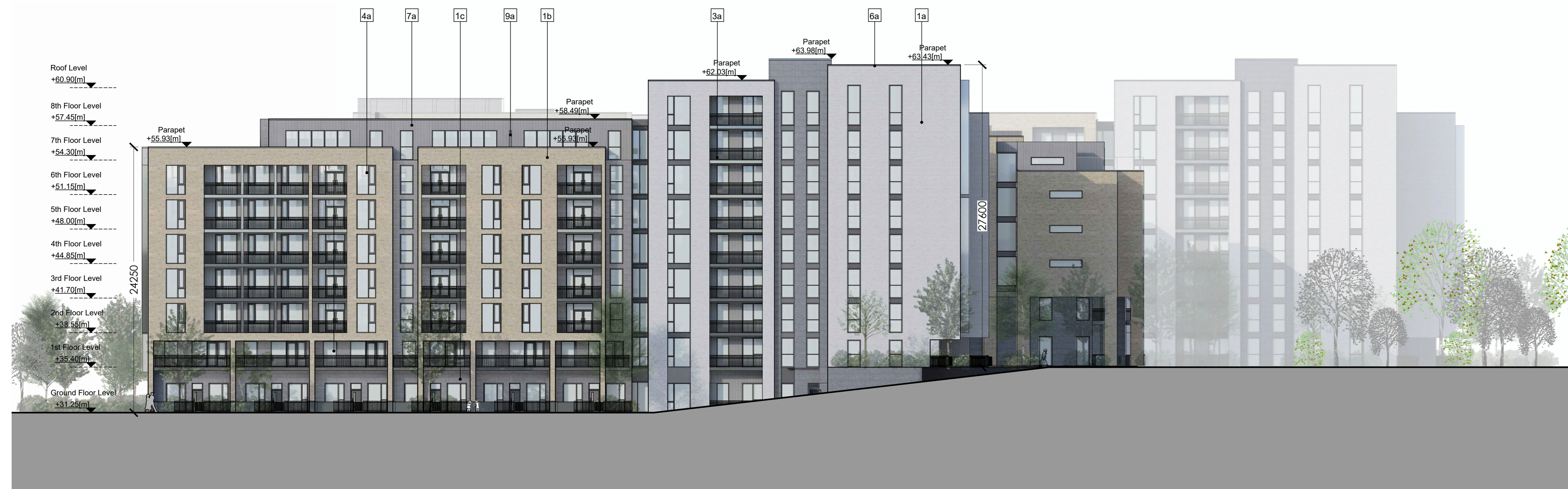
01 - West Elevation - Block 4